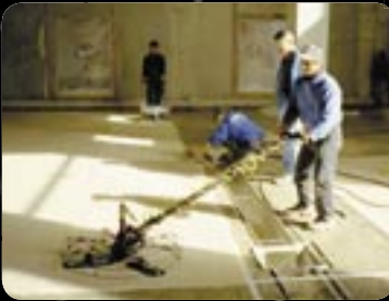
Afula, Israel Denisra International, PPM