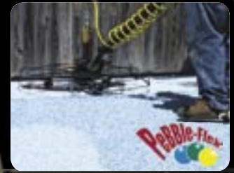
Bradley Beach, NJ, USA Pebble-Flex Safety Surface Thermoplastic Beads