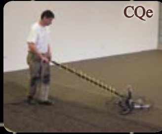
Overpelt, Belgium Colour Quartz europe nv Open Stone System