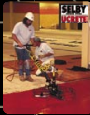
Harrisburg, PA, USA Houck Services, Inc. Selby/Ucrete HF