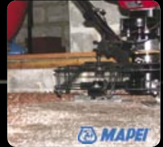
IMI Institute, NJ, USA MAPEI®, Terratop™ Terrazzo System