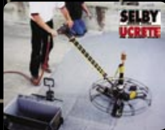
Houston, TX, USA Selby/Ucrete HF Workshop