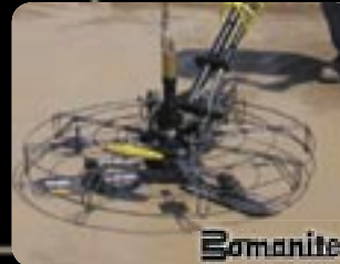
Madera, CA, USA Bomanite Color Hardeners