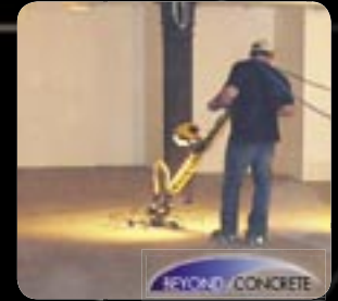
Manhattan, NY, USA Beyond Concrete Bomatop Epoxy Topping