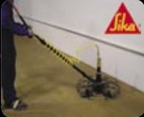
Auckland, New Zealand Brockliss Contracting Sika Epoxy Floor Screed