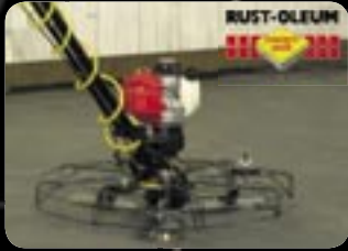
Arlington, TN, USA Walker Composites, Inc. Rust-Oleum FlorClad